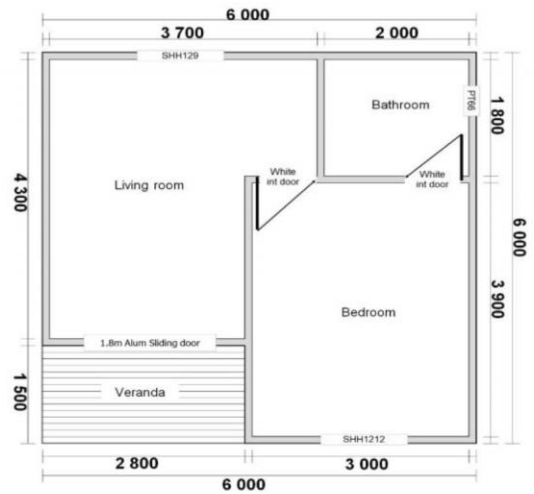
6 X 6m ONE BEDROOM